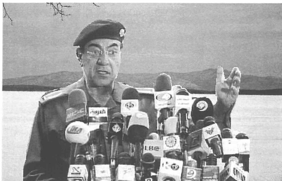
Iraqi Information Minister declares Ice Out for Lake Winnepesaukee on April 14

The LWSA stays afloat through the efforts of its volunteers, through your memberships and generous donations, and through the donation and resale of boats. You should know that last year we sold a Capri 25, a catamaran and an outboard, and currently have three substantial boats for sale, listed elsewhere in this issue. Please keep your eyes open for prospective donors and buyers, and please join the LWSA!